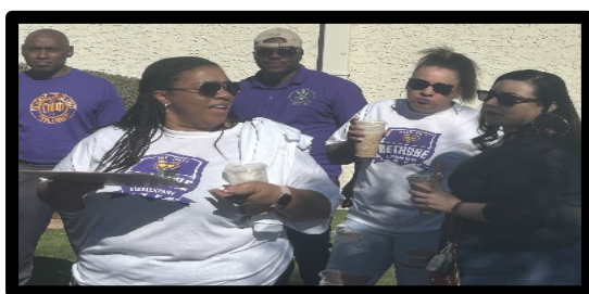
Bethune Elementary Principal and Staff directing OYLA Mentors during Turkey Distribution